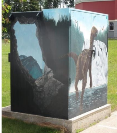
Painted Electrical Box

Life-like scenes of caves, mountains, waterfalls and dinosaurs were painted on this electrical box in 2009 by Joan Zimmer.