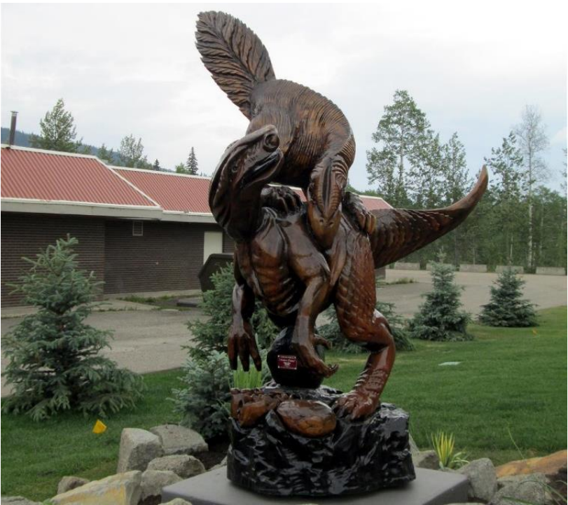
Chainsaw Carving beside the Visitor Centre

This attractive log building was completed in July 2015. It houses Visitor Information Services, which is managed by the Tumbler Ridge UNESCO Global Geopark (TRUGG), along with office space for TRUGG staff. The building boasts in-floor heating, and large windows that overlook some of the adventure destinations visitors might want to see.