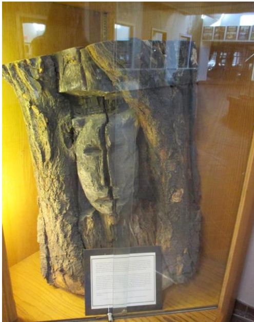
A Culturally Modified Tree found near Flatbed Creek