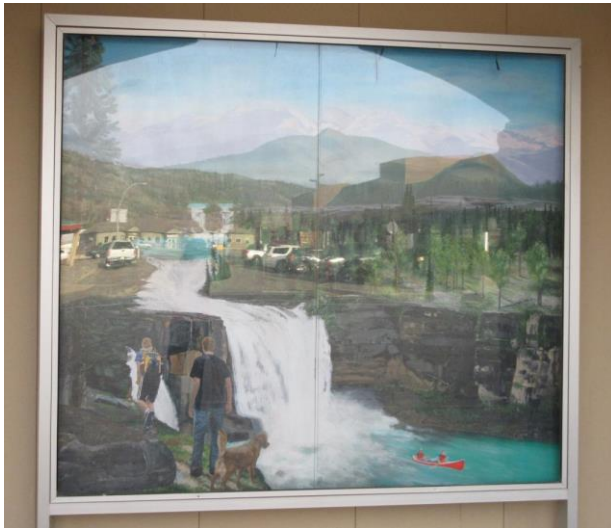
Community Centre Murals