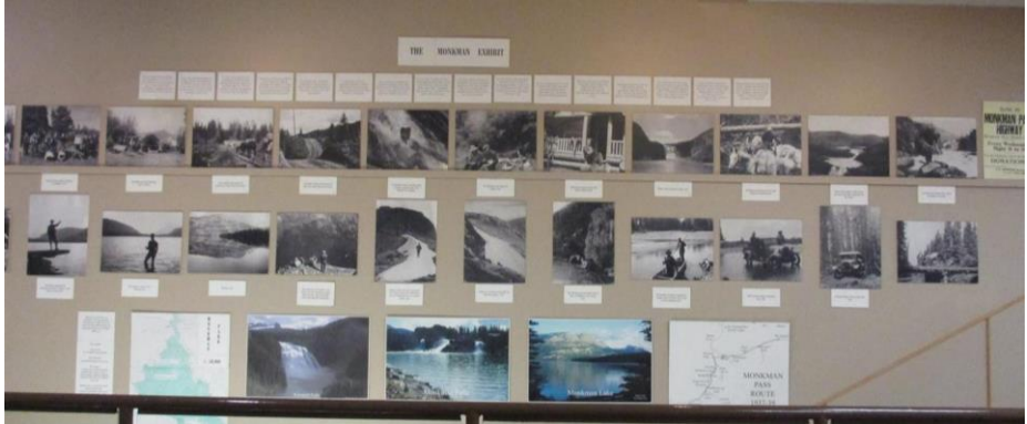
The Monkman Exhibit in the Tumbler Ridge Community Centre

The Tumbler Ridge Museum Foundation has thirty displays in the Community Centre, including the history of the early explorers and pioneers, the first maps of the area, information on archaeology, the creation of Tumbler Ridge, fossil displays and a Sports Hall of Fame.