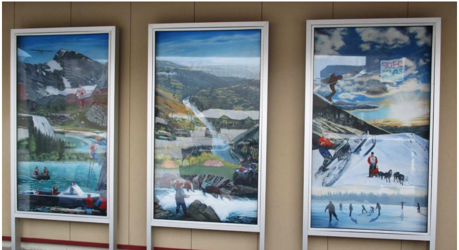
Community Centre Murals

Joan Zimmer used photographs of local activities and scenery to paint the five mural collages on this wall. They showcase everything from skating, dogsledding, snowmobiling and skiing in winter, to boating, fishing, hunting, rock climbing, finding dinosaur footprints, swimming, running and hiking in our outdoor wilderness.