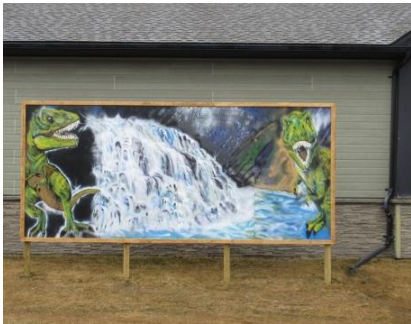
Kinuseo Falls Mural