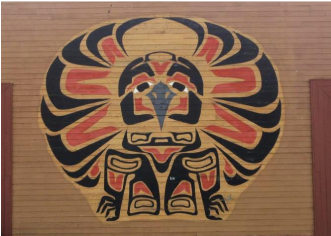
Indigenous Art on Shop Easy Building

This indigenous artwork has been on the outside of the grocery store in town since the early years.