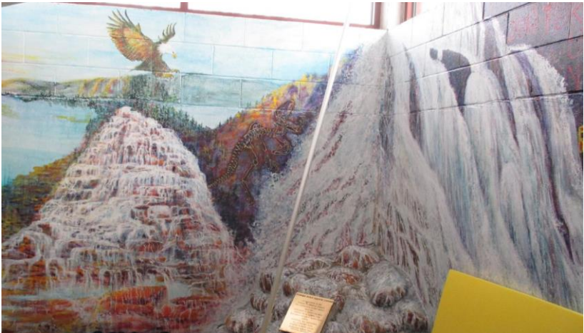
Quality Falls and Kinuseo Falls Painting