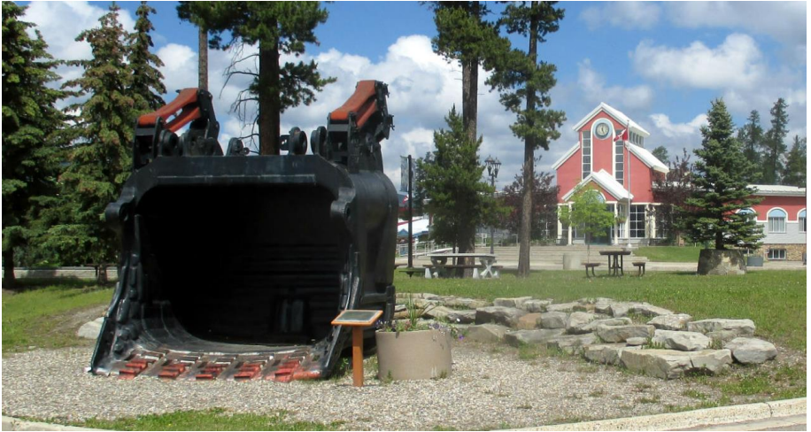
Mining Shovel Bucket

This bucket is from a P&H electric shovel, model 2100BL. It was donated by Teck Corporation and installed here by LaPrairie Crane in August 2005 to commemorate the two original coal mines in Tumbler Ridge. The Quintette mine was originally owned by Denison Mines Ltd., and the Bullmoose mine was owned by Teck Resources Ltd. The bucket has a capacity of 15 cubic yards - stand inside and see how big it really is!