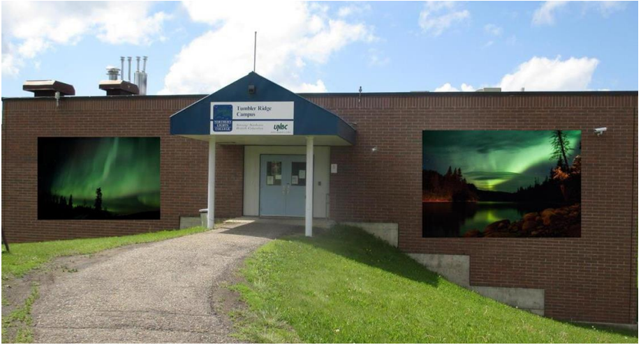
Northern Lights College Photos