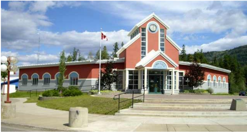
Tumbler Ridge Town Hall

The municipality of Tumbler Ridge was incorporated in April 1981, with construction of the town infrastructure happening over the next two years. This included the Town Hall, which was designed by Downs/Archambault Architects and won an award by the Architectural Institute of British Columbia in 1984. Seen from above, this building is shaped like a dove. Inside you will find council chambers, friendly staff, and a stuffed grizzly bear.