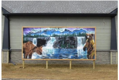
Monkman Falls Mural