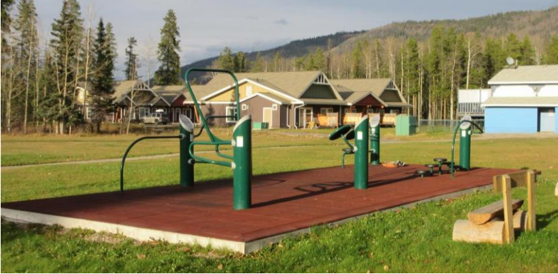
Outdoor Exercise Park

This outdoor exercise park was built here to be close to the seniors housing complex. It was installed in 2011, and has benches for resting between sets of exercise.