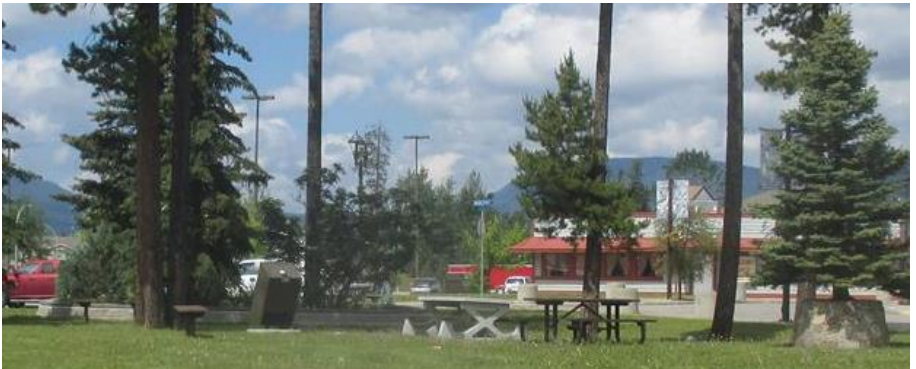
Town Hall Park

This park across from Town Hall has benches and picnic tables, and is a lovely spot to stop and enjoy a snack or picnic lunch, and take in the view.