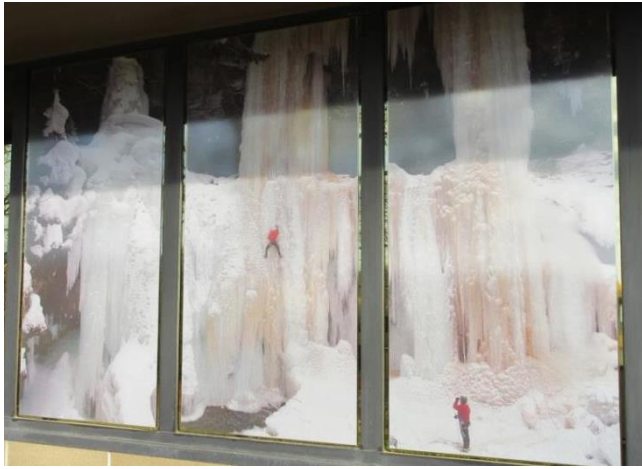
Ice Climbing Photo